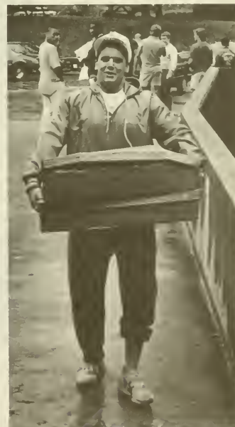
New resident students struggled against the rain as they moved in on the Sunday before Labor Day.